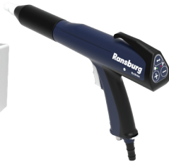
Elite M5 Ergonomic Manual Powder Gun Model 615210