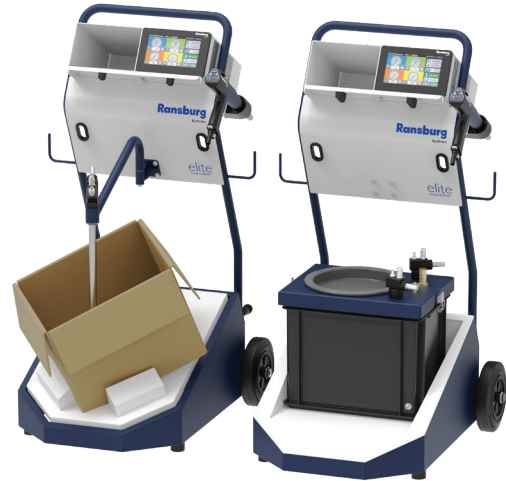
Fluid Hopper Unit Model 805700-FH