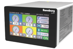
Elite S5 Controller Model 461959